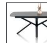
pied central (supplément)